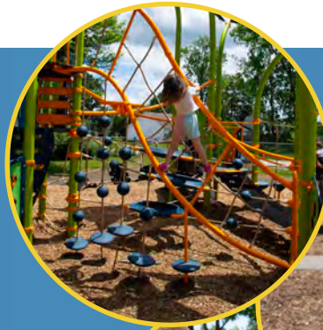
NEW AT RENAISSANCE PARK