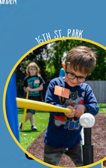
16TH ST. PARK